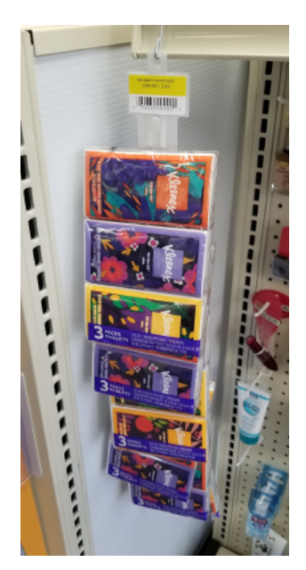
In addition to hanging the Kleenex packs on a peg hook, store personnel can also hang the product on a merchandising display strip.

The R-02 Hang Tab is provided on a roll and can be hand applied or machine applied to the package with a high-speed hang tab applicator.