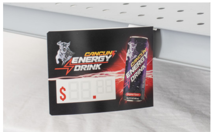
The digitally printed wobbler can be seen from both directions as it intrudes into the aisle.