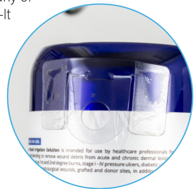
Do-It's R-GEK Fold-Up Hang Tab remains folded down until the bottle is ready to hang.

In the serious industry of wound irrigation, Clyra can focus on their end users and have no concerns about the hanging performance of the Do-It R-GEK Hang Tab.