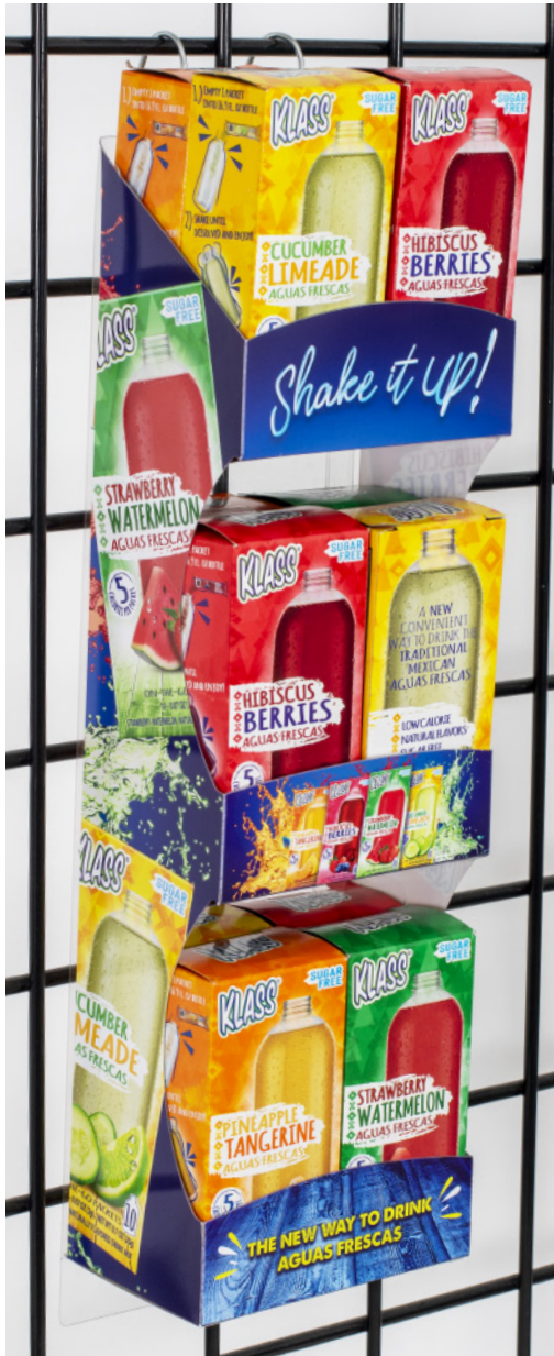
Each strip can hold up to 12 boxes of On-The-Go flavored drink mix.