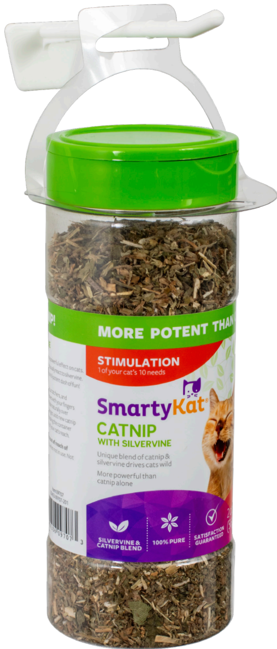
The 2-BBD Bottle Neck Hang Tab stays flat until store personnel decide to hang the product.